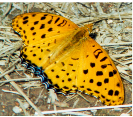
Indian Fritillary (Argyreus hyperbius)

photography (and for me !). The most common was bright vellow specked with brown on the underside - the Grass Yellow. there were some blues. Skippers and some with browns verv little marking. I did not get to the top as I found a lower hilltop where a number of larger butterflies were establishing their territory including а beautiful Indian Fritillary and a Dark Cerulean which is an